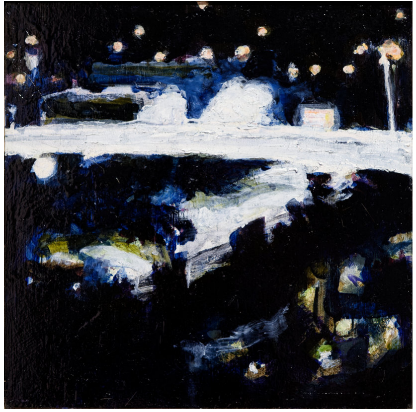
Albion Park #4 2024, Oil on ply, 30 × 30 cm $1,100