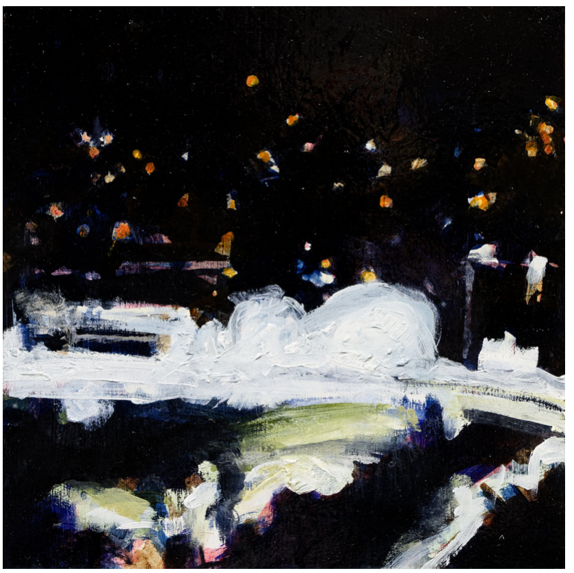
Albion Park #6 2024, Oil on ply, 30 × 30 cm $1,100

Albion Park #2 2024, Oil on ply, 30 × 30 cm $1,100