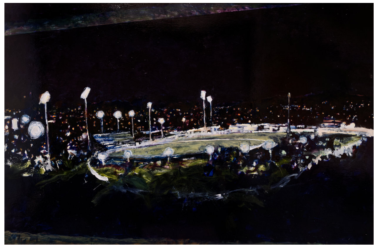
Albion Park #9 2024, Oil on ply, 120 × 183 cm $4,000